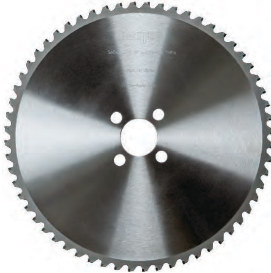
Throw-Away TCT Saw Blade