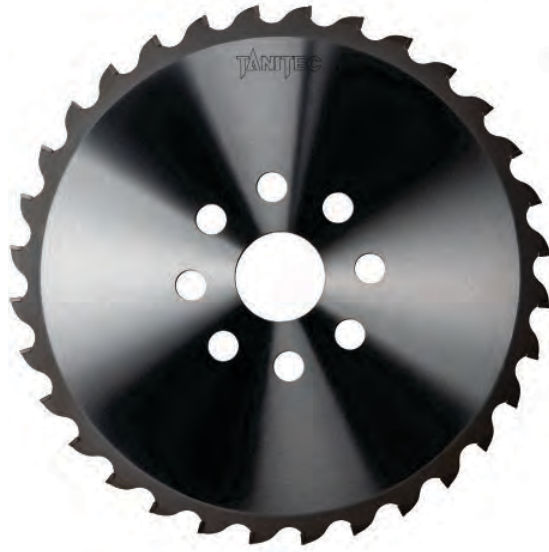
Standard Hard Metal Saw Blade