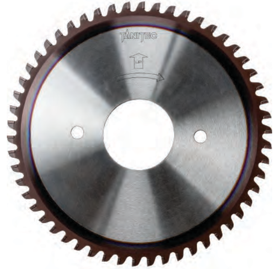
Saw Blade for Milling Cutter