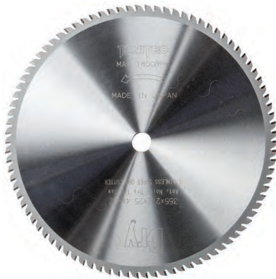
Dry Tip Saw