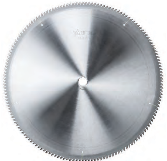
TIP SAW for nonferrous metals